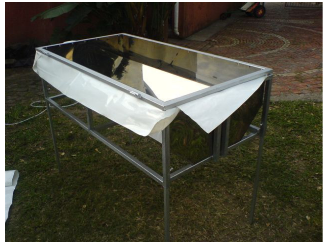
Lid fit into bottom part for easy storage or transportation.

Please note that our machines come with a window for viewing the hog as it cooks with minimal disruption to latent heat.