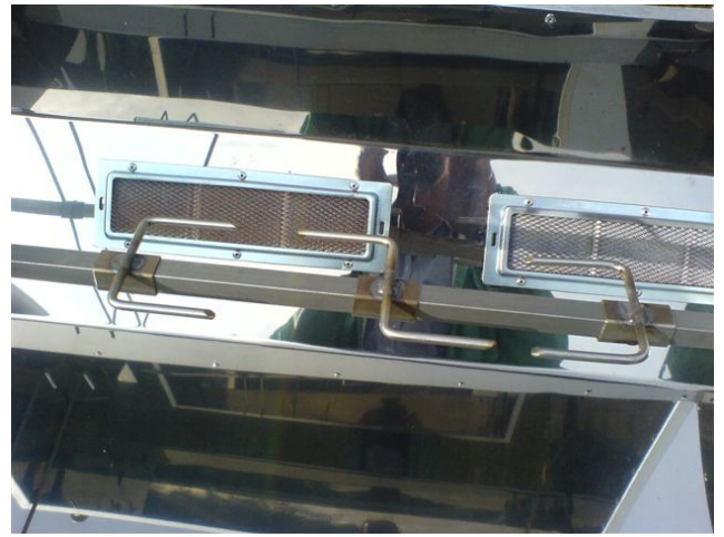
Spear and forks for Chickens or roasts.